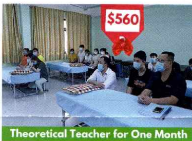
Theoretical Teacher for One Month

A group of dedicated teachers work tirelessly at the Training and Rehabilitation Center for the Blind to ensure students are taught all of the practical skills required to ply their trade including traditional massage & acupuncture.