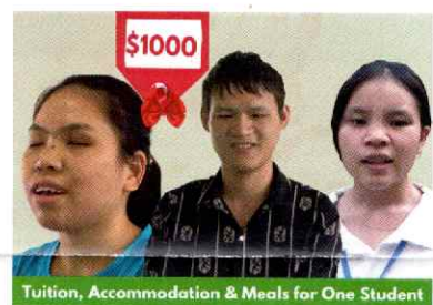
Tuition, Accommodation & Meals for One Student

Theoretical teachers teach students the theory of massage, along with the structures of the body and the effects of their movements.