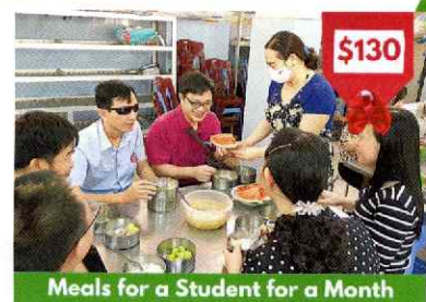
Meals for a Student for a Month

Course books are specifically designed for the students at the Training & Rehabilitation Center for the Blind and facilitate their learning of theory for body systems.