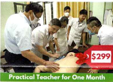
Practical Teacher for One Month

Accommodations and meals are provided for all students so that they may stay at the Centre and devote their time to learning. $130 will cover the cost of meals for one student for a month.